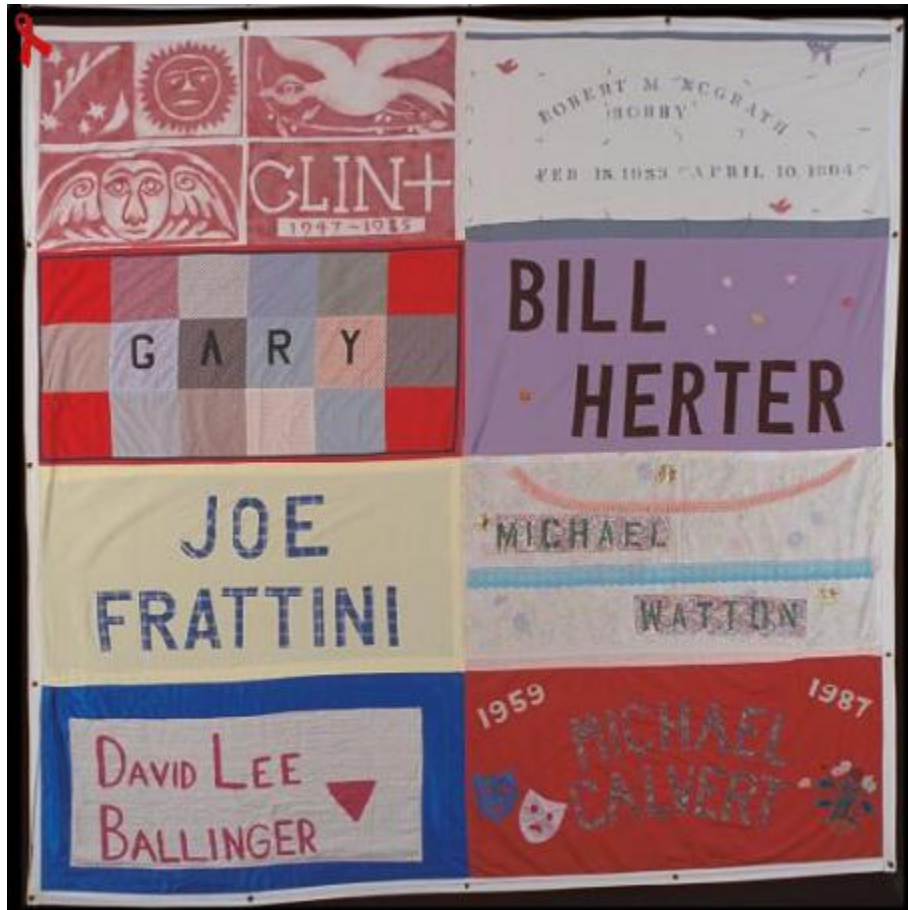
These are the names on Block # 140

Therefore, at Ray Of Hope Church Of Our Lord Jesus Christ, we continue to read aloud over 110,000 names sewn into the AIDS Memorial Quilt to keep HIV/AIDS in the conscious prayers of people. Scroll the page to see the panels on block 140.